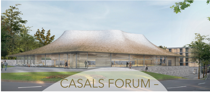
Casals Forum, Beethovenplatz 1, 61476 Kronberg/Ts.